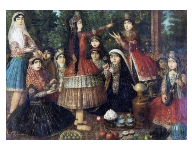
Figure 9: Qajar women with short corrugated shalites based on European ballerinas' style

Clothes designing satisfies both the desire to be in harmony with others and to be separated from them in a society. Therefore, by introducing a new