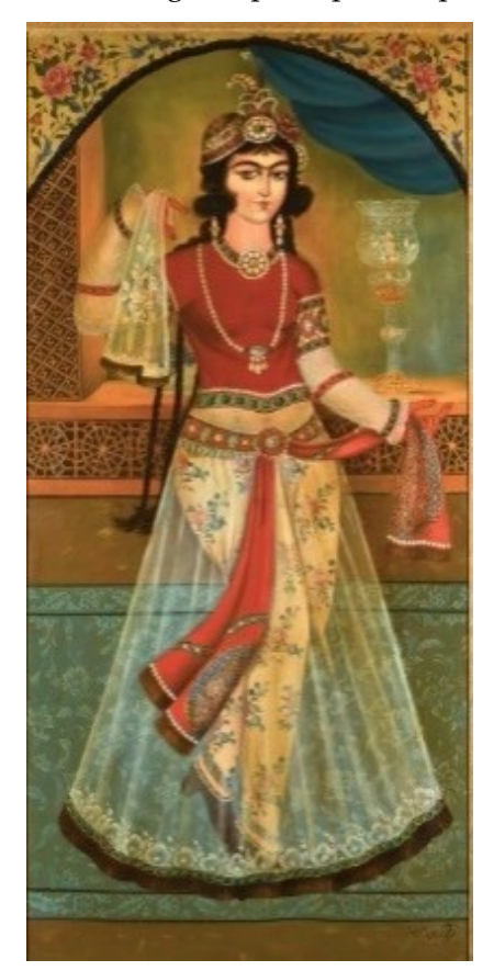
Figure 6: dancing maiden, Qajar woman with thin silk skirt to control sweating and skin health

Abstractness in designing equals with creativity and unpretentiousness, while having the principles of practicality and dressing up. According to