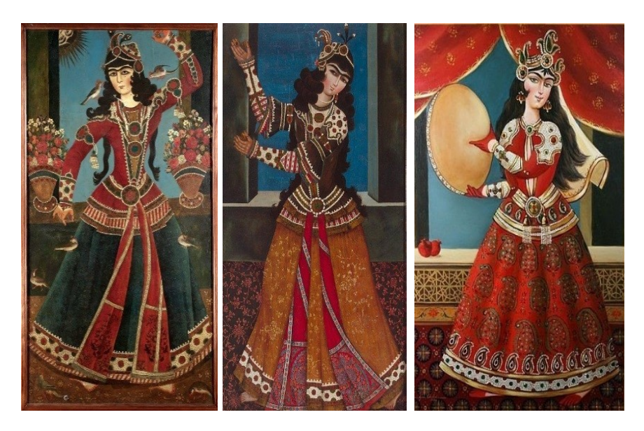
Figure 10: Qajar women with clothes full of ornaments and needlework based on Iranian-Islamic motifs such as botte jeqqe