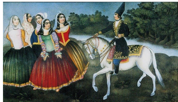
Figure 2: Types of Qajar women's headgear with a quadrangle or a ribbon tied around the head with its upper collars

They also attached a feather called jeqqe to the straps around their head. Later, charghad became popular. Charghad was a thin, square