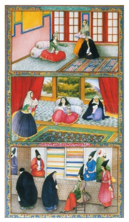
Figure 1: common clothing of Qajar women inside and outside the house

Clothing, which is one of the most essential human needs and has a history as old as his biological life, has found many manifestations commensurate with different periods, thus it cannot be separate from the history of human thought. According to Anne Hollander, the body has a different shape and texture with or without clothing, so it becomes something new when the clothes shows up.<sup>13</sup> This interpretation clearly shows the power of clothes designing, thus the most important part of clothes designing, without which it becomes only a cover to protect the body, can be considered as the creation of new ideas. In his book Clothing and Fashion , Kelsie Cruse referred to the high power of clothes designing as wearable art for conveying values,