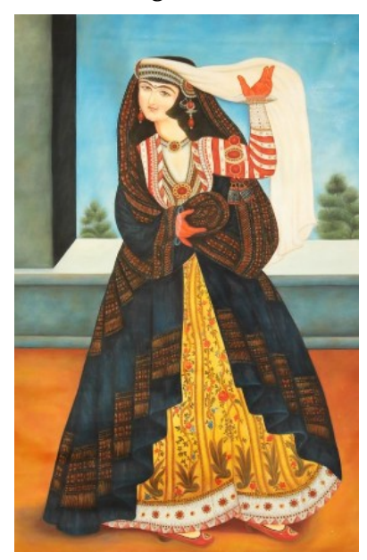
Figure 5: Full coverage of Qajar woman with embroidered chador and loose pants

Covering in Islam means having hijab within the framework of Islamic law and the custom of society. Thus, its primary characteristic is to cover the body in a way it avoids nakedness while not being diaphanous which is clearly shown in Qajar women's clothes while colorful, beautiful and having a few pieces indicated in the illustrated documents. Figure 4 shows three types of covering: an old woman with a chador, burka and pants corrugated at her ankle; a court woman wearing a corrugated arkhalig (a long tight-waist jacket), and a headband; and maids with arkhalig, corrugated skirts, and charghads pinned under their chin. It must be mentioned that all women were dressed in navy blue chadors, and green, purple, gray or red