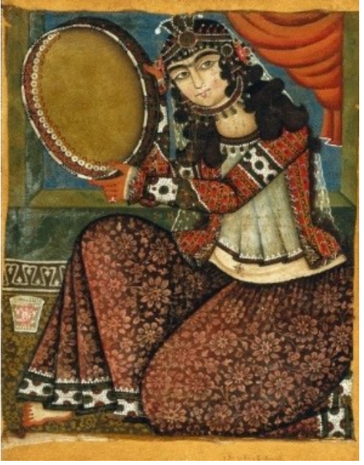
Figure 3: The Qajar woman's head covering inside the house is hung as a decorative hat and lace

Clothing in Persian is a sign of human dignity and means, in its explicit sense, to wear, cover or put on clothes. According to The Culture of Nakedness and the Nakedness of Culture by Haddad Adel, clothing also has implied meaning and is considered as а means of concealing the body.22 Strabo, the Greek historian of the 1st century B.C. mentioned, if a part of Iranians' body was naked, they considered immodest and most people wore ankle length clothing.23 In fact, the primary function of clothing was a response to the intrinsic