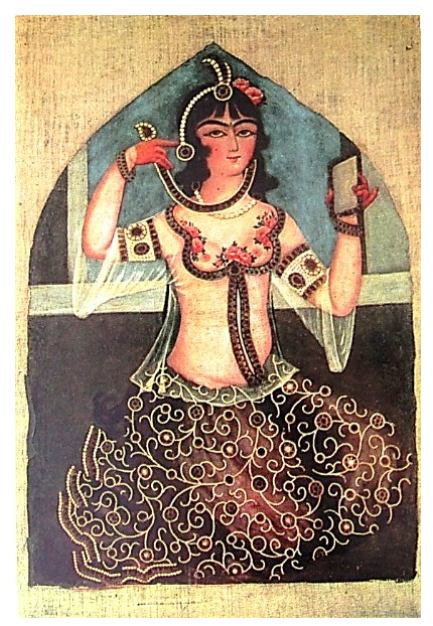
Figure 7: Qajar woman with thin silk skirt and embroidered tight pants for ease of sitting and moving